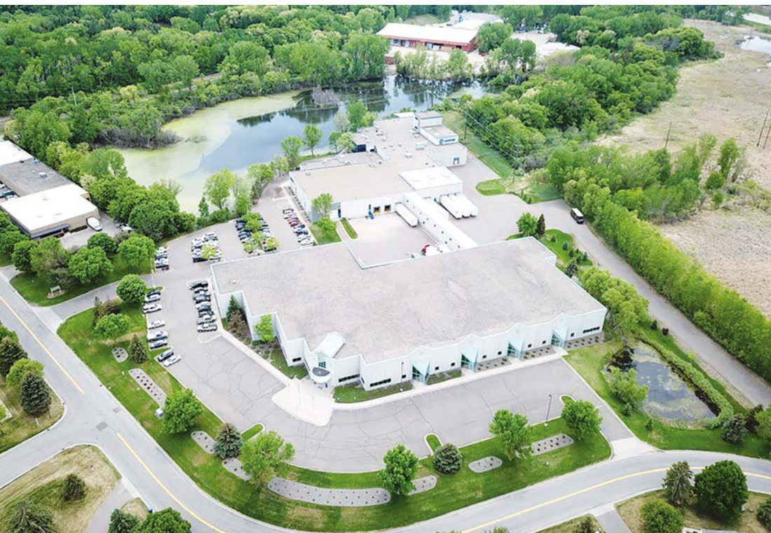
The Cortec® Corporation's headquarters in St. Paul, Minnesota (United States).

“I have dedicated my life to developing new green technologies in the corrosion industry, and this award is a great honour. All my investments have a sustainability focus, and my vision from the beginning was to develop environmentally safe solutions”.